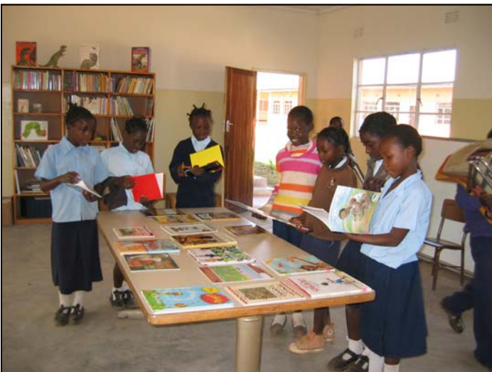
4th Grade Library