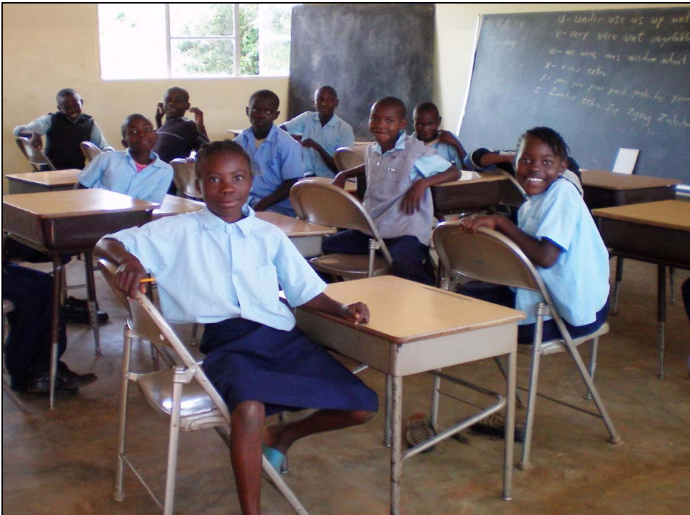
Children enjoying the new classrooms.